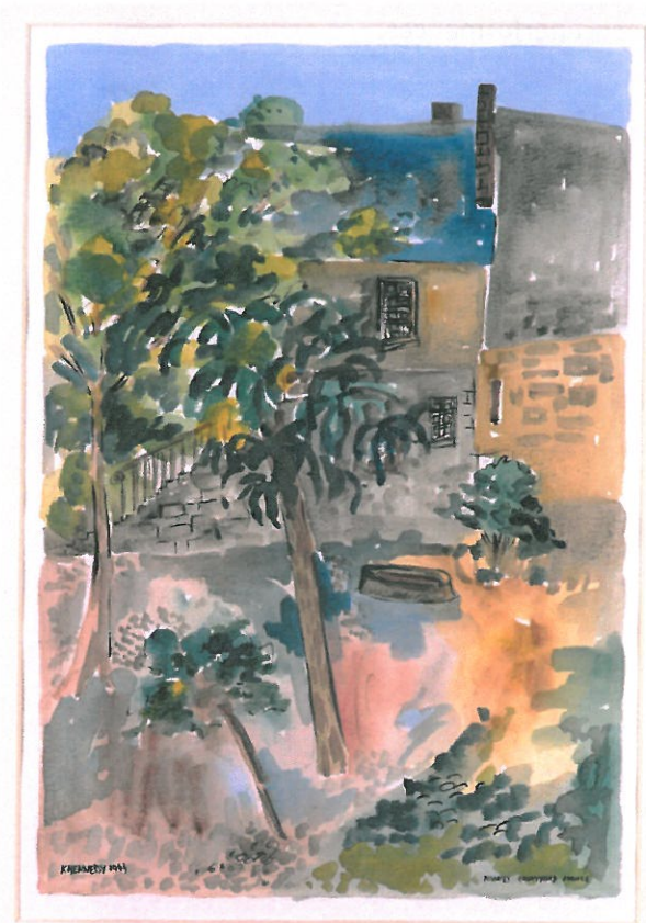
Kate Hennessy, Courtyard, Nantes No. 2 (1999)

In fine art painting, the term 'Watercolour' denotes a painting medium in which colour pigments are bound in water-soluble agents. Originally, these binders were animal glues or certain sugars, but nowadays the standard substance is gum arabic. In China and Japan, watercolour art is the universal painting medium, except that East Asian watercolourists typically use only black inks. Watercolour dries much faster than oil painting and permits the creation of finer, more precise works of art. However, regular exposure to light causes colour to fade, and many masterpieces have suffered irreparable damage.